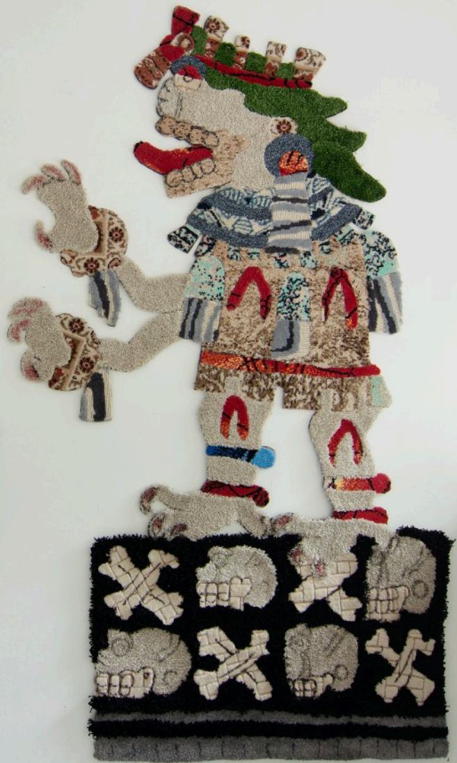
María Sosa El encubrimiento de los dioses; Magliabechiana el gran deformador (díptico), 2021 Assembly of industrial textiles with acrylic applications 180 x 108 cm (2x)