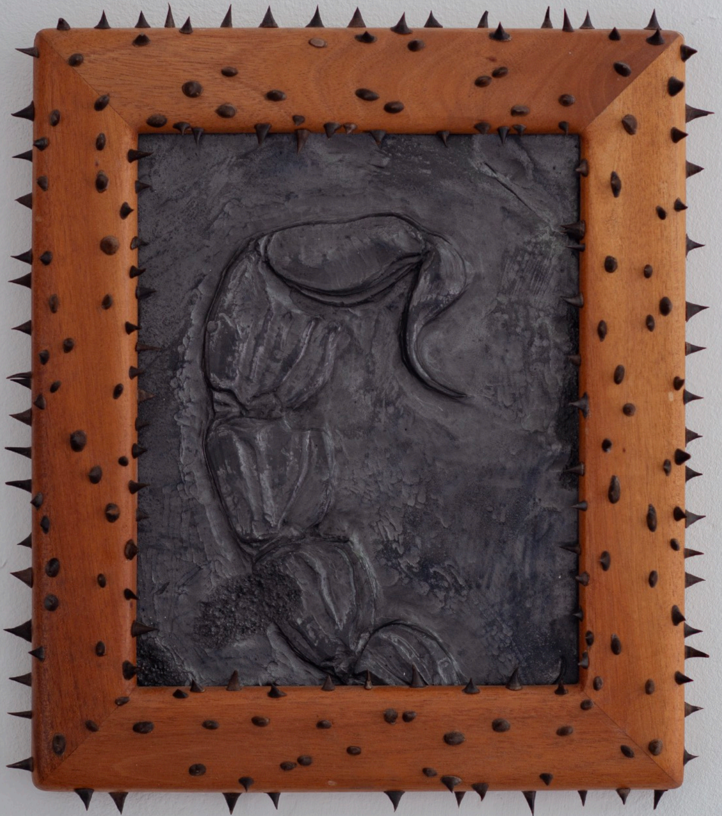
Chavis Marmol Veneno de escorpión azul, 2023 tzalarm wood, resin, graphite Size varies