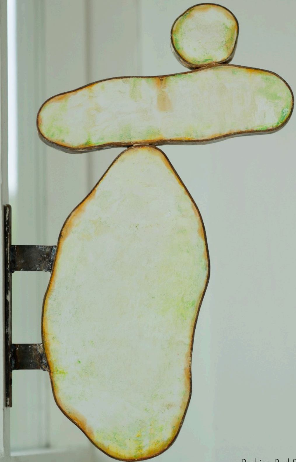
Rodrigo Red Sandoval Stone Pile (9-to-5 erosion) Metal, plaster, pastel 45 x 50 x 3,4 cm