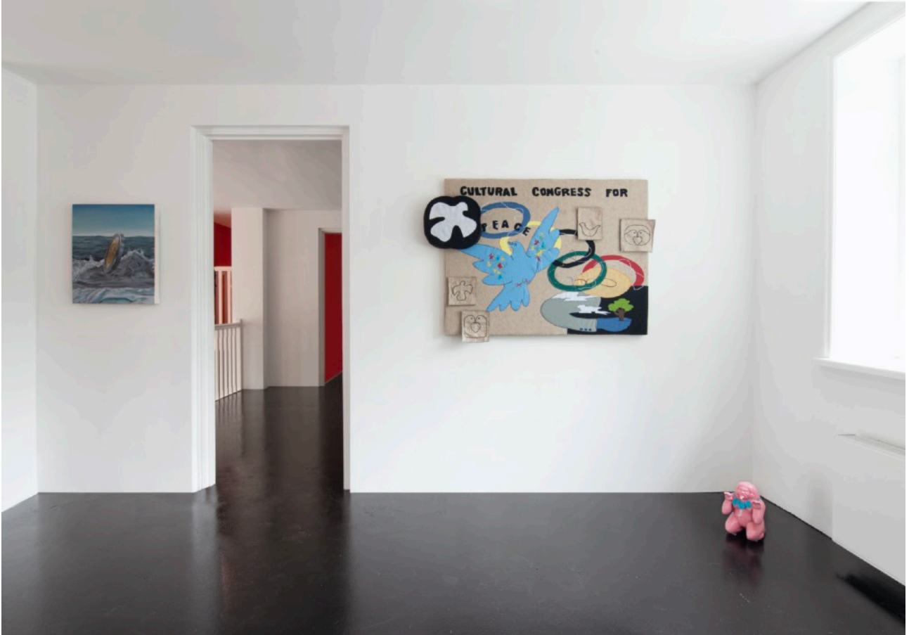
Exhibition overview of 'Las estrellas me iluminan al revés', 2023, No Man's Art Gallery, Amsterdam.