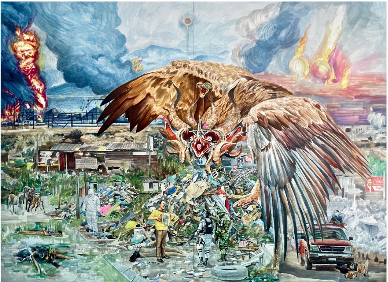
Alejandro Galván Las estrellas me iluminan al revés, 2022 Gouache and watercolour on wood panel 180 x 244 cm