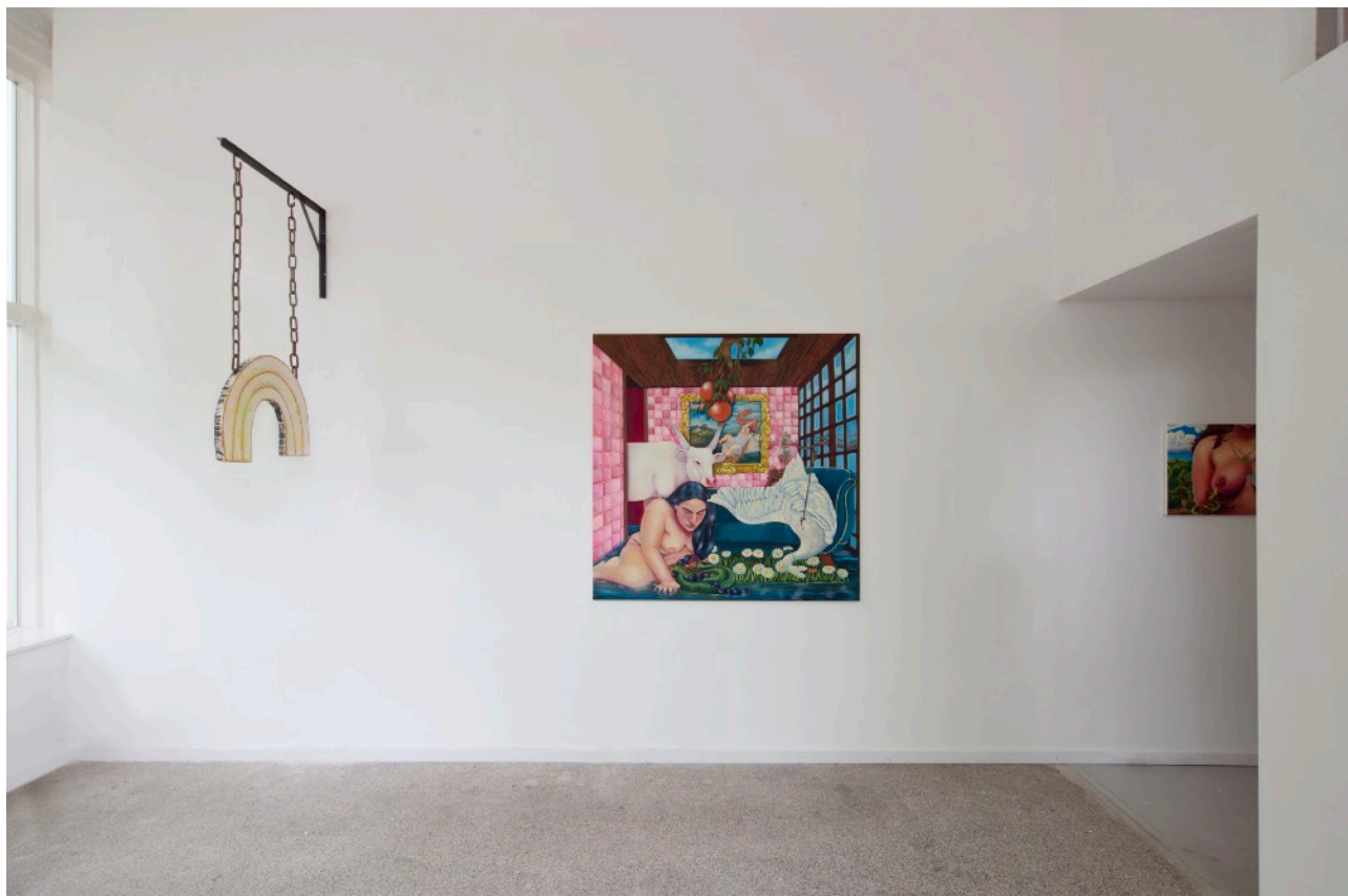
Exhibition overview of 'Las estrellas me iluminan al revés', 2023, No Man's Art Gallery, Amsterdam.