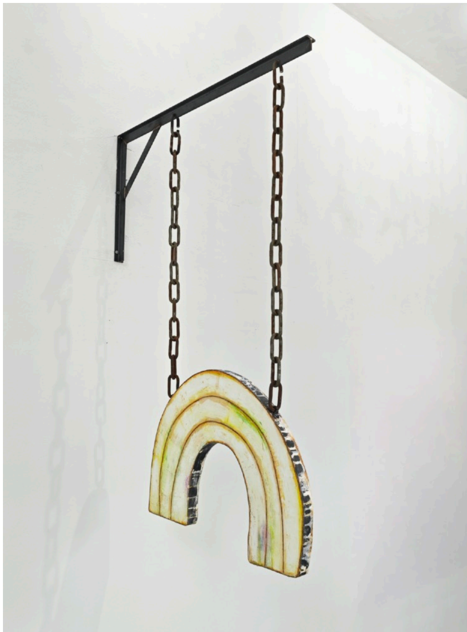
Rodrigo Red Sandoval Weathered Chroma (9-to-5 erosion) Metal, plaster, pastel 115 x 80 x 3,4 cm