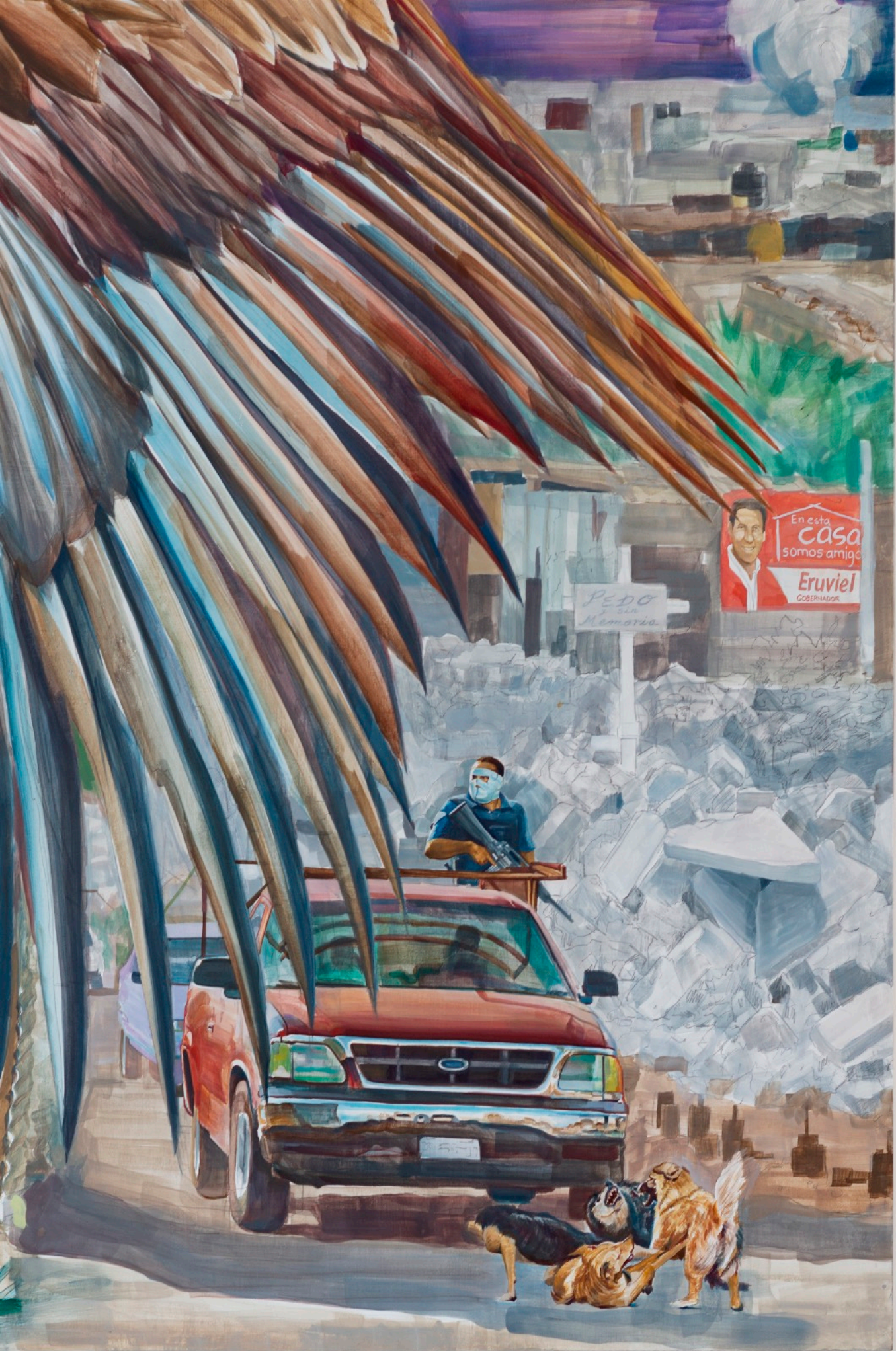
Alejandro Galván, Las estrellas me iluminan al revés , 2022 (detail)