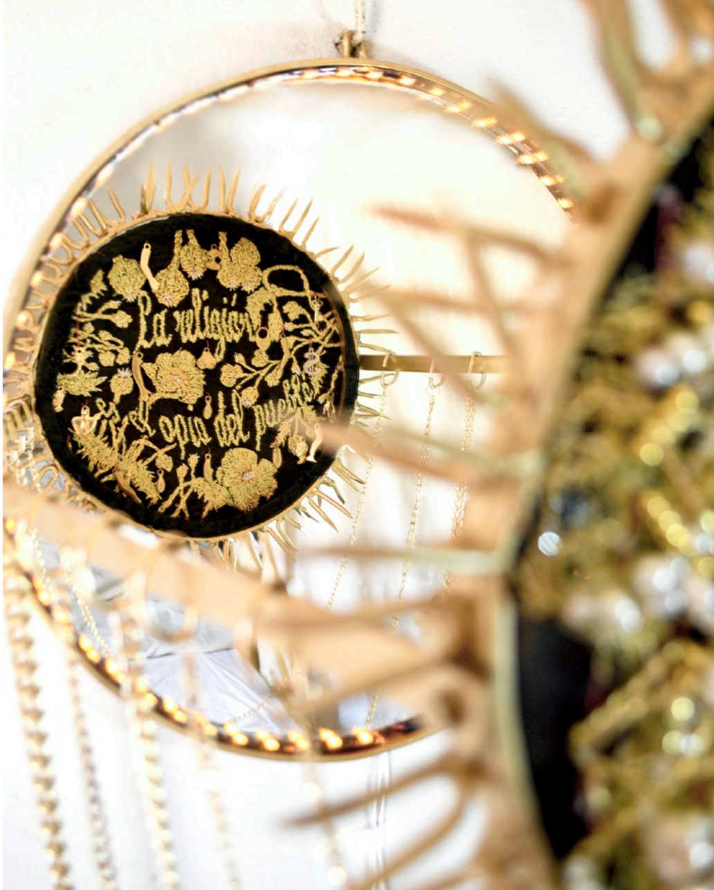
Alan Hernández La religión es el opio del pueblo, 2021 Fabric, embroidery, mirror, metal, led light, and miracles 40 x 50 x 50 x 60 cm