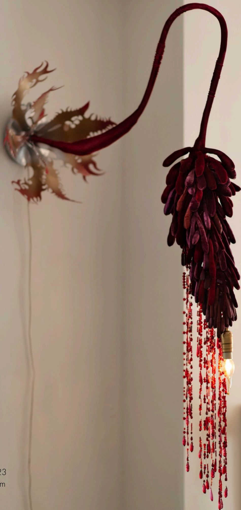
Alan Hernández Flor de sábila, 2023 50 x 110 x 160 cm