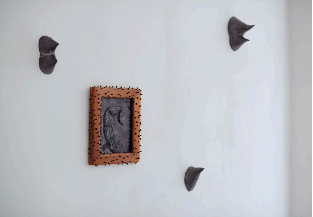
Chavis Marmol Veneno de escorpión azul, 2023 tzalarm wood, resin, graphite Size varies