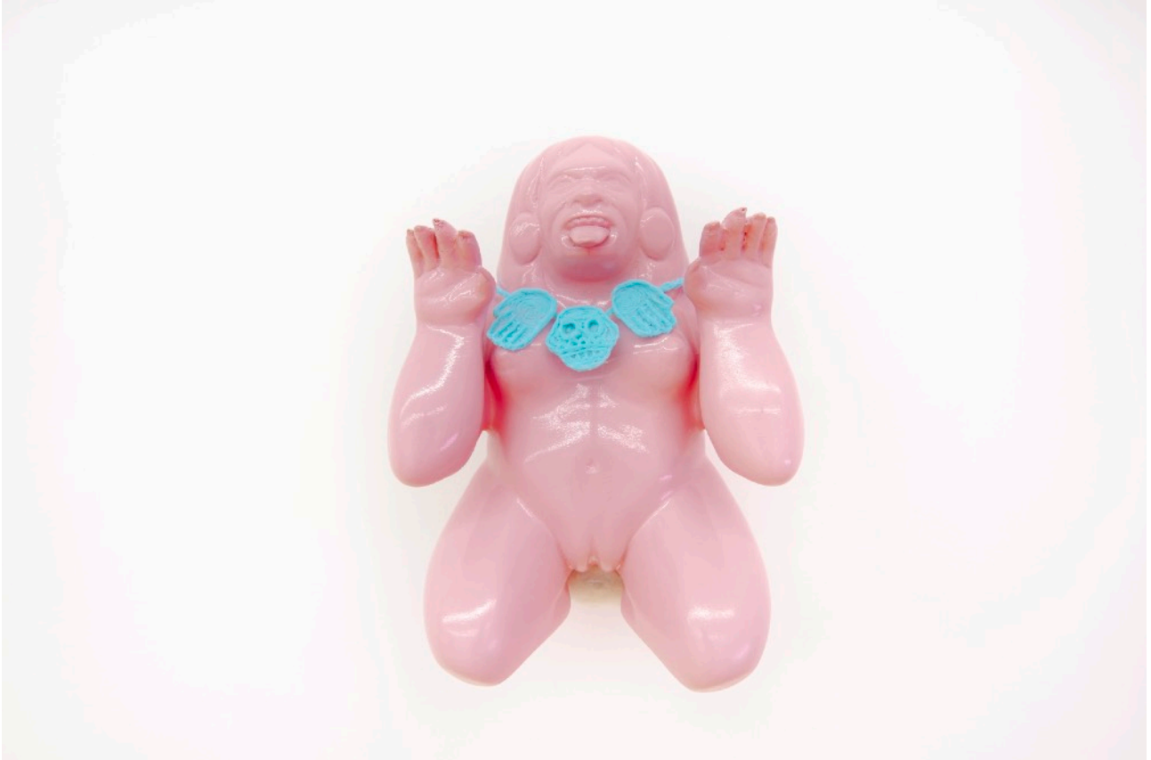
Ileana Moreno Garpha Spektra 2, 2022 3D additive printing (PLA) and acrylic 28 x 18 x 20 cm