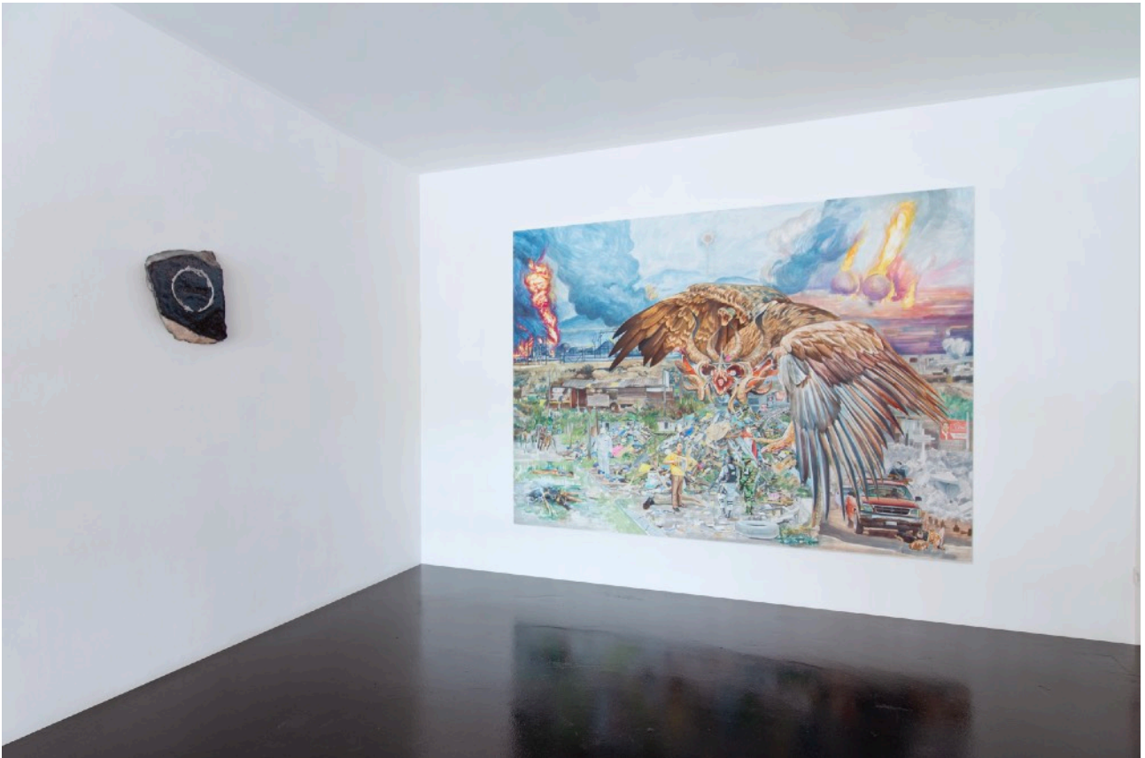
Exhibition overview of 'Las estrellas me iluminan al revés', 2023, No Man's Art Gallery, Amsterdam.