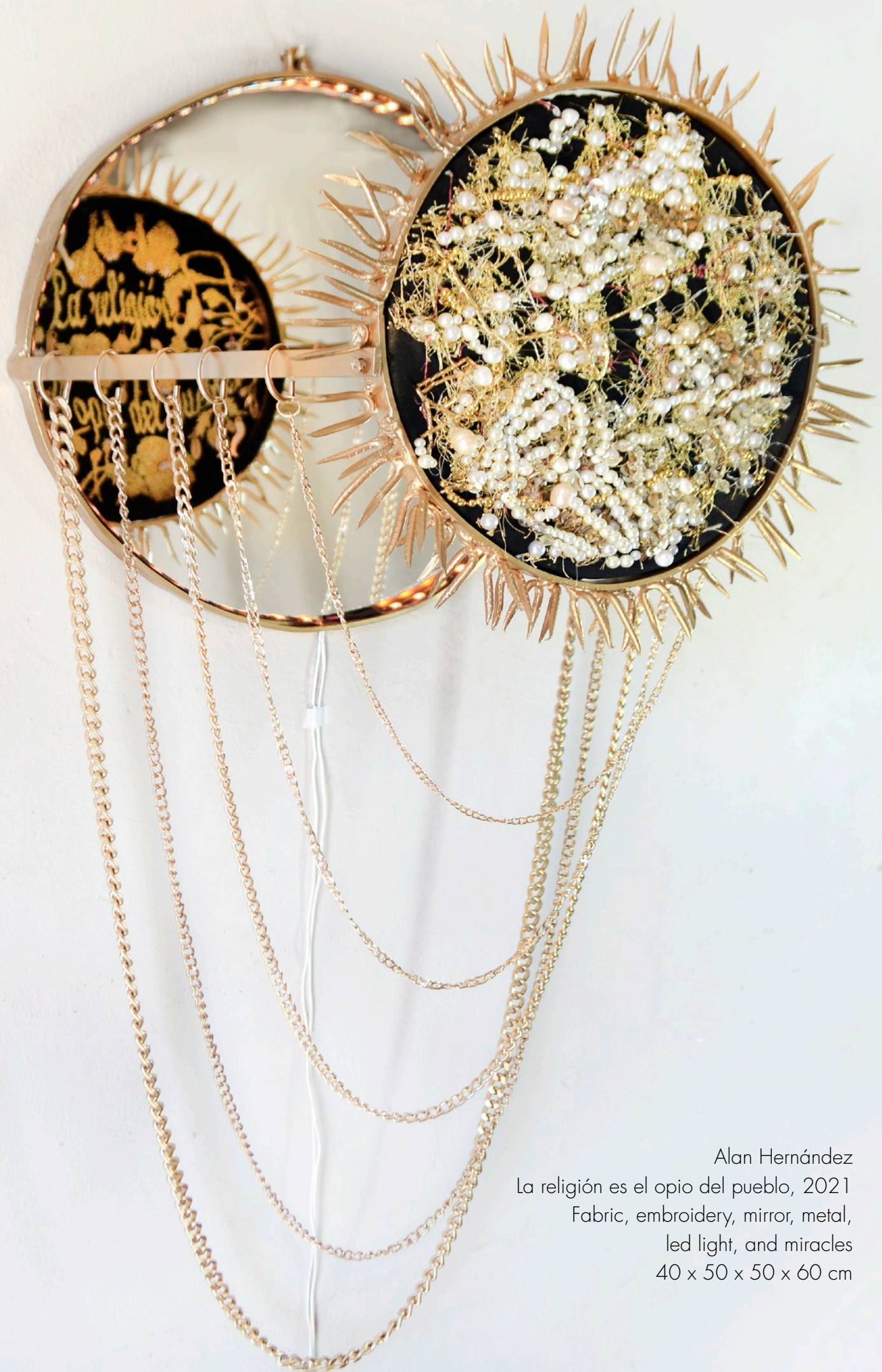
Alan Hernández La religión es el opio del pueblo, 2021 Fabric, embroidery, mirror, metal, led light, and miracles 40 x 50 x 50 x 60 cm